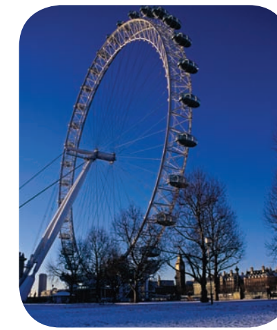
Clockwise from left: Liberty's impressive building Department store Selfridges Ice skating at Somerset House The London Eye in winter The Nutcracker

A roast goose or turkey is the Christmas Day dinner of choice across Britain, along with mince pies, Christmas pudding and cake. To try some of the best, check out food halls such as Harrods (or Cheval