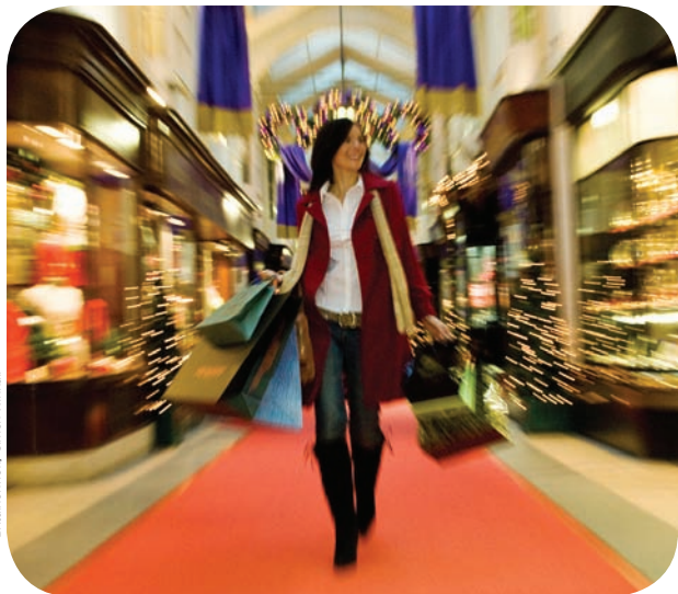
Britainview/ Simon Wainall

Menus made up of small tasting plates have proved a massive hit with London diners, with restaurants ranging from Indian to Spanish offering a range of grazing dishes so you can experience the full talents of the kitchen. Acclaimed restaurant Le Cercle has a grazing menu made up of regional specialities from all over France and guests at Phoenix House can now eat the same food in the privacy of their apartment. The Gourmet Grazing menu has seven sections to choose from including Marin (fish and seafood), Fermier (meat and game), Plaisirs (richer, more luxurious dishes, some with caviar or foie gras), and Gourmandises (desserts).